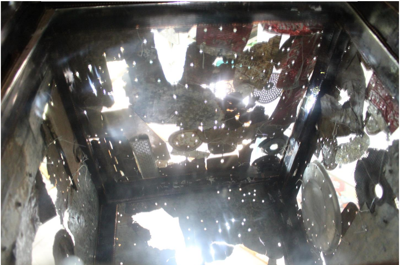
מבט פנים הבית