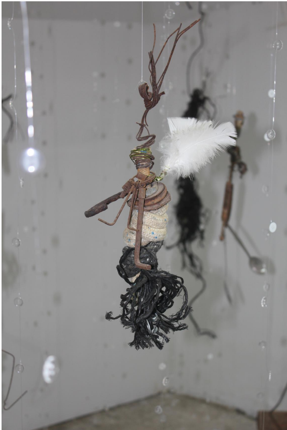
חלודים , פרט , 5X15X40ס"מ טכניקה מעורבת