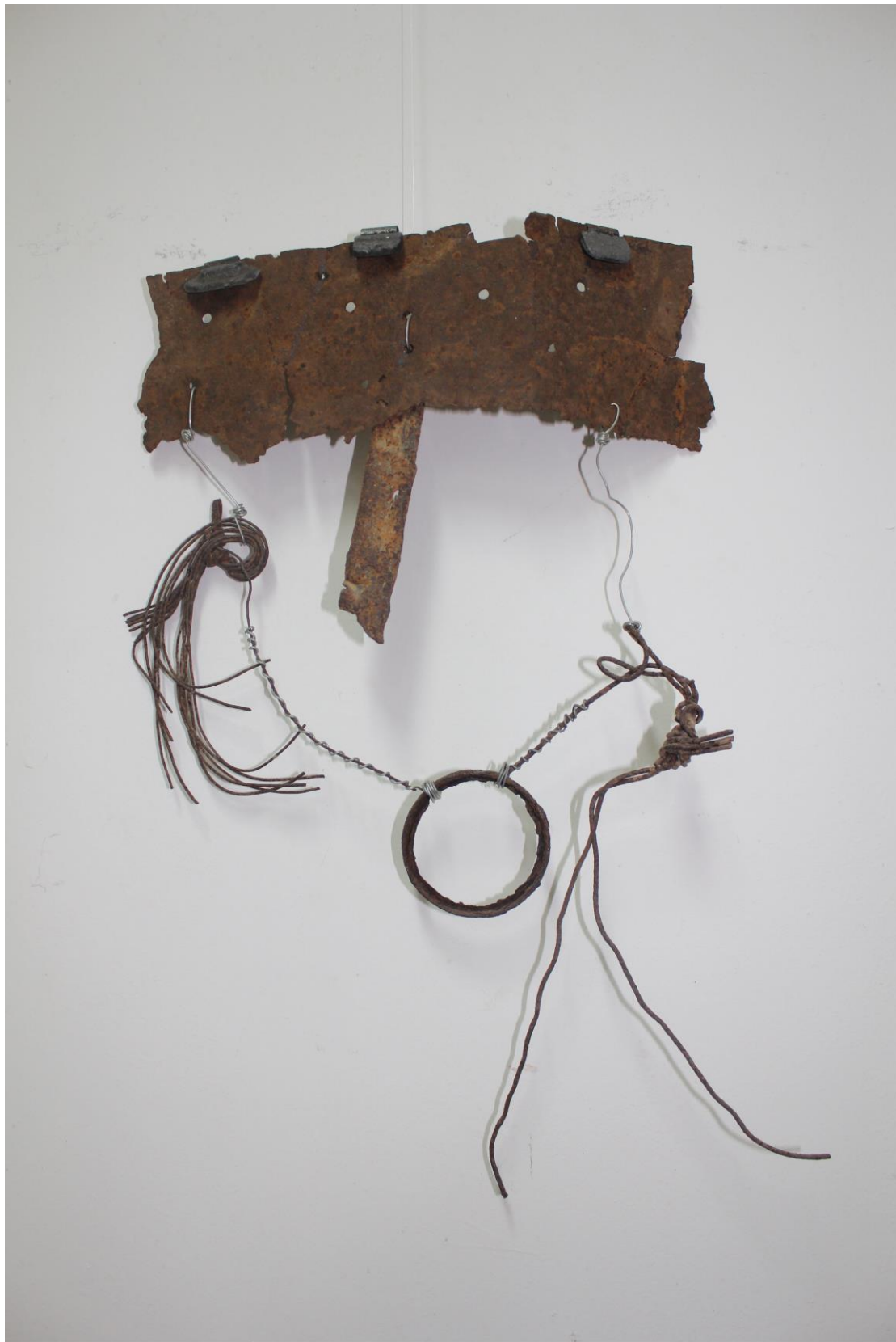
חלודים . פרט , 5X40X30ס"מ טכניקה מעורבת