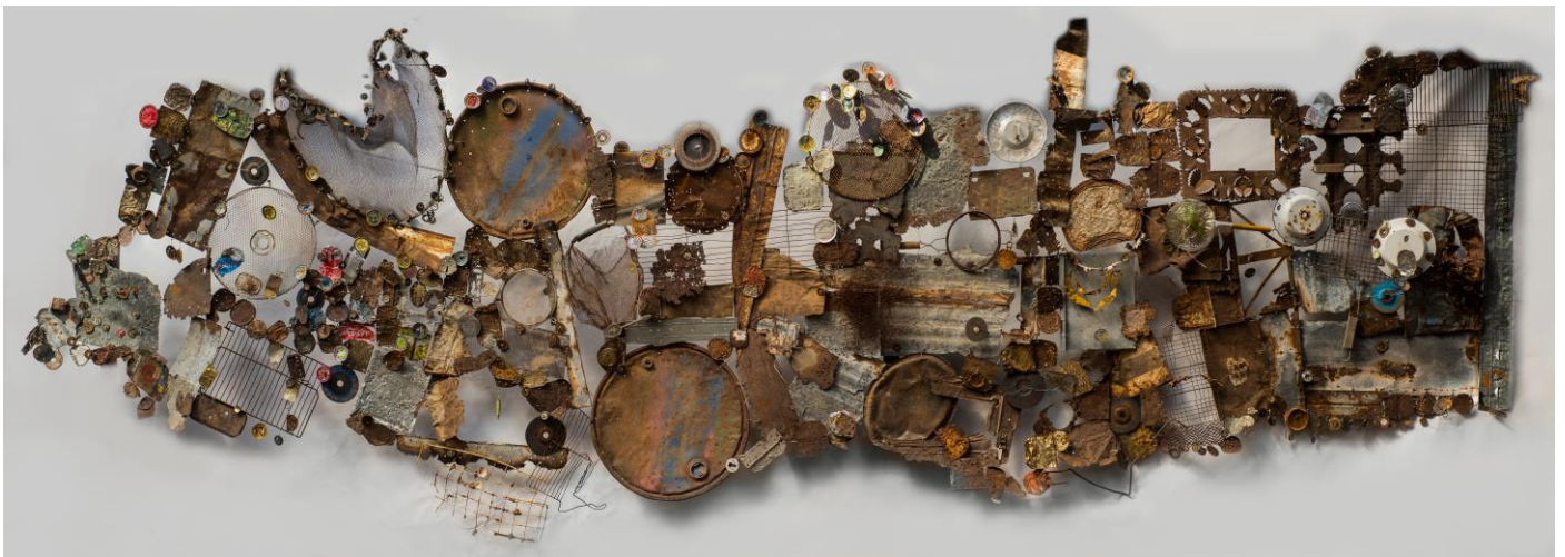
שטיח תפילה לשלום