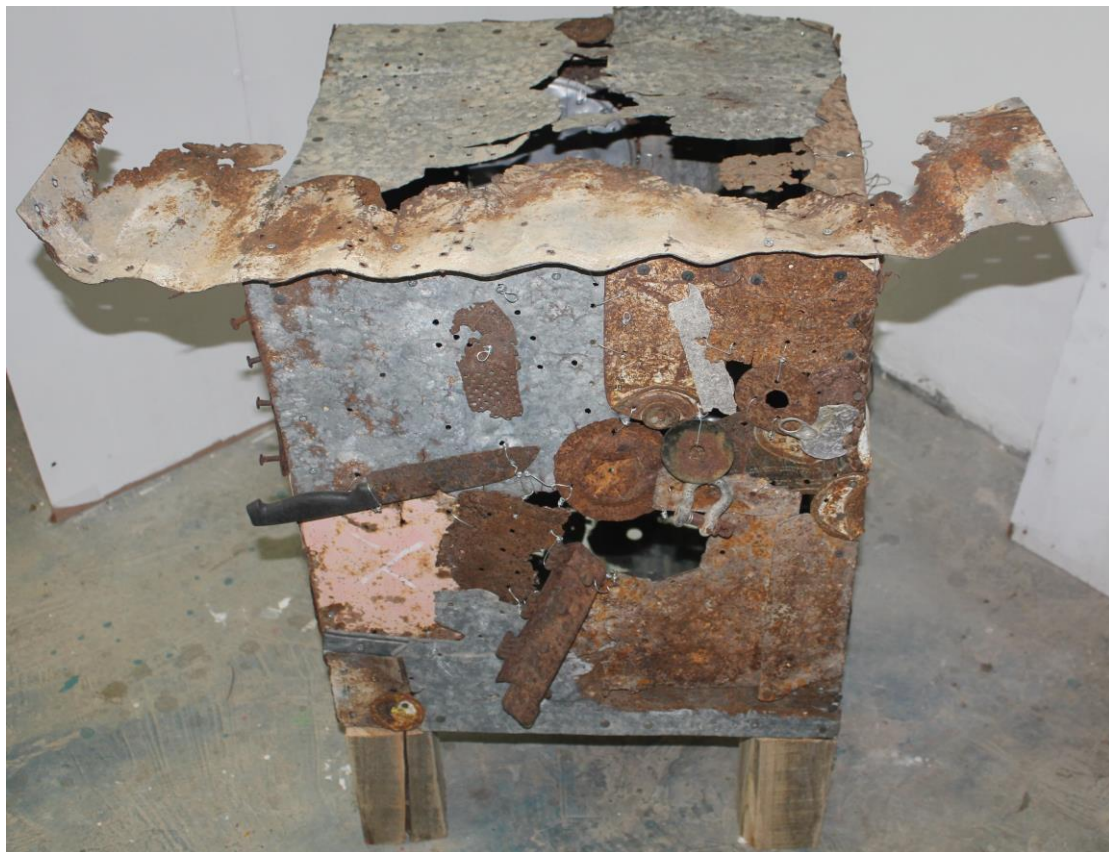
בית 1 מבט 2