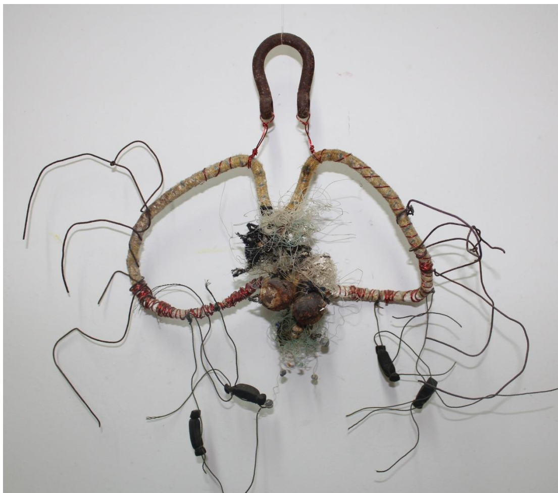
חלודים, פרט, 40X40 ס"מ טכניקה מעורבת