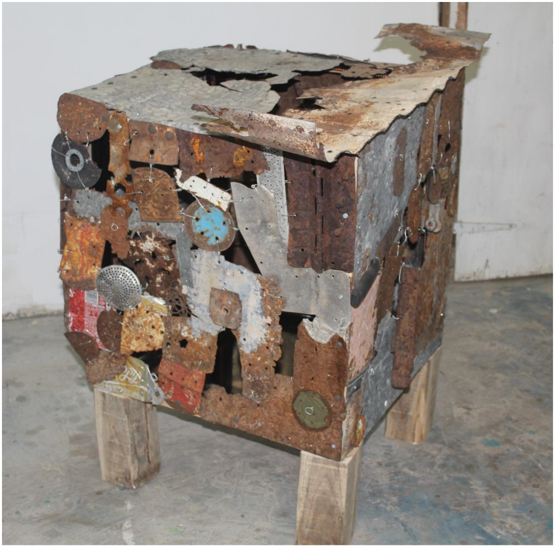
בית 1 - 80 X 55 X 56 ס"מ