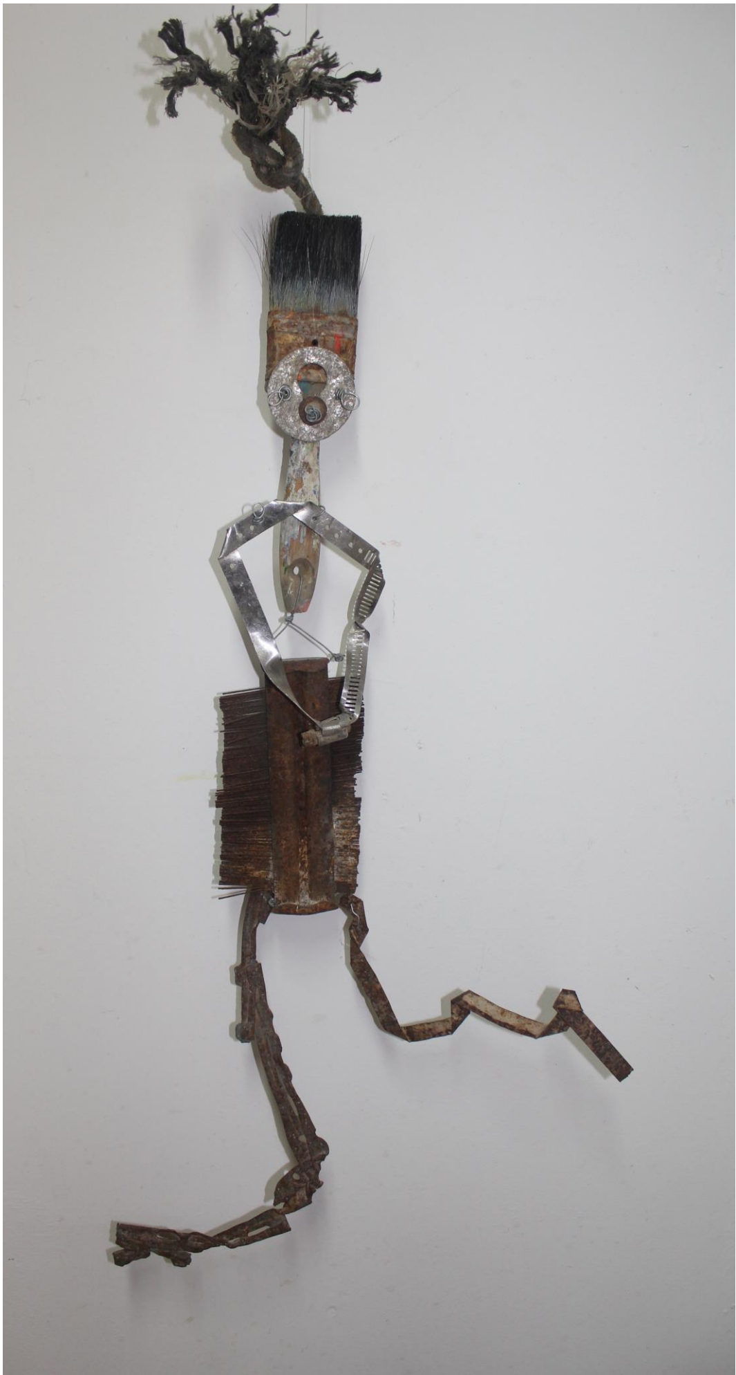
חלודים , פרט , 5X20X70 ס"מ טכניקה מעורבת