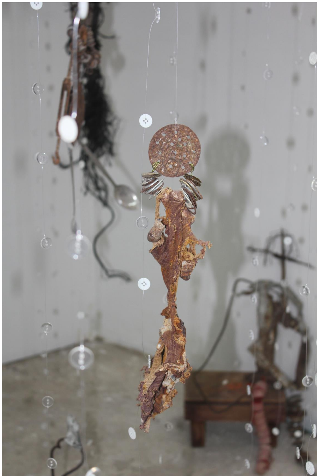
חלודים, פרט, 35 X 60"מ טכניקה מעורבת